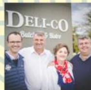
De La Fontaine - Deli-Co