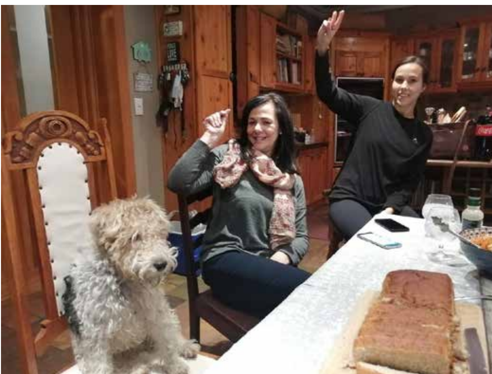
Landbouskrywers- mannewalis