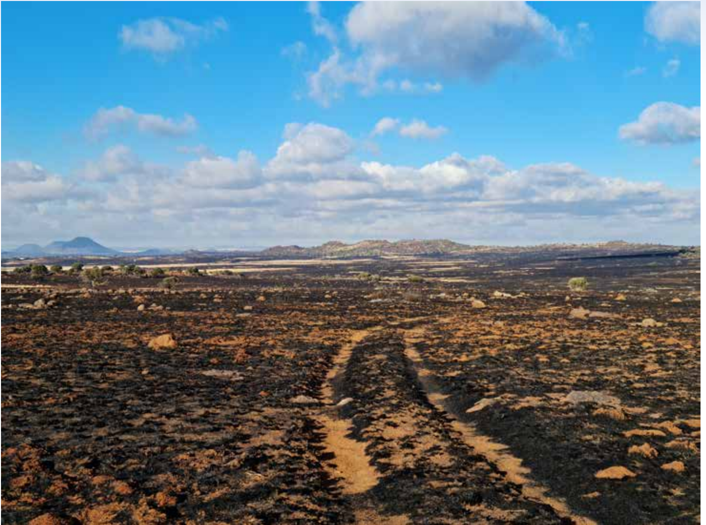
The devastation caused by the recent fires in the Free State is clearly visible.