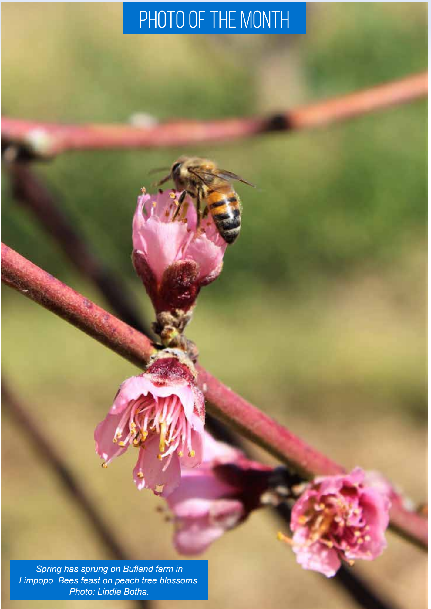
PHOTO OF THE MONTH

Spring has sprung on Bufland farm in Limpopo. Bees feast on peach tree blossoms.